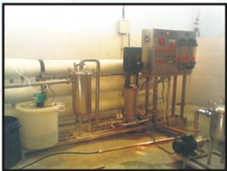
Industrial R O Systems