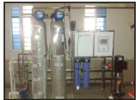
R O System with Remote Monitoring