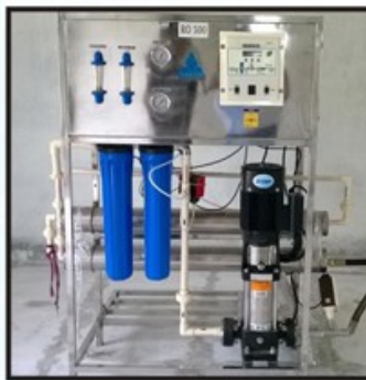
SS R O Unit