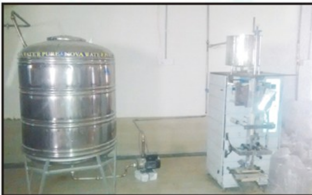
SS STORAGE TANK AND POUCH PACKING MACHINE