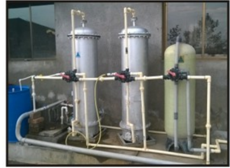
3 Bed Deionizer Plant (DM)